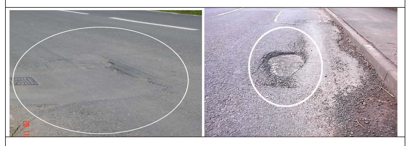
Damage types = reinstatements